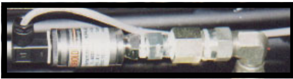
Typical Installation of the ED2-FW Series Pressure Transducer in Lifting Hydraulic Circuit

done by lifting the empty and loaded forks.